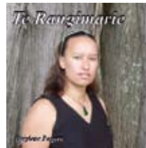
Te Rangimarie $10

If you would like to purchase any of these Cds please contact: