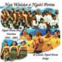
Nga Waiata o NP $20