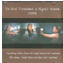
NP Hui Taurima 2005 $25